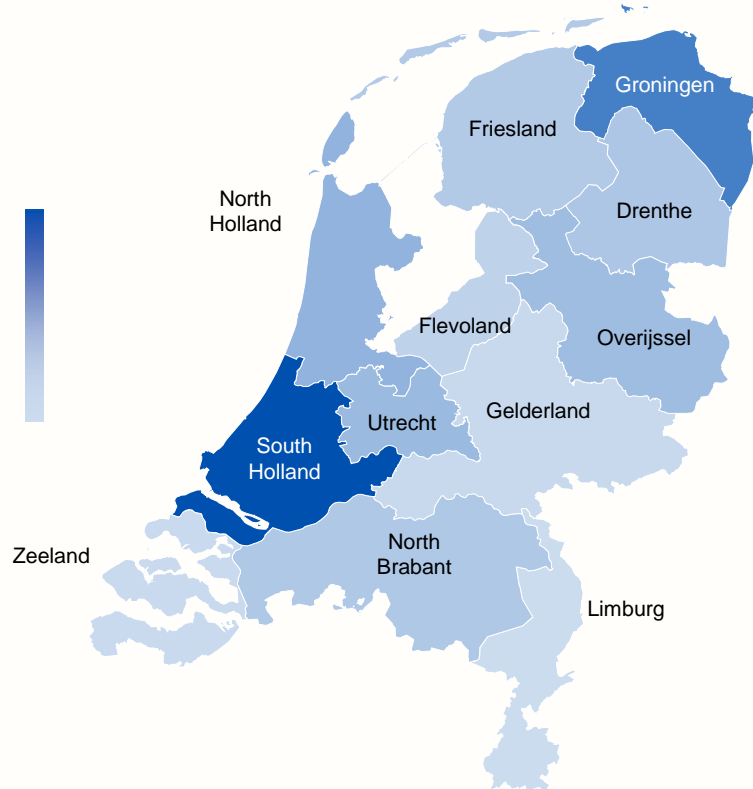
Ratio of Nursing Homes over Residential Care Homes by Region