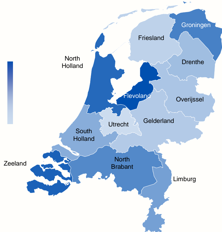
Number of Inhabitants over 65 per Home by Region